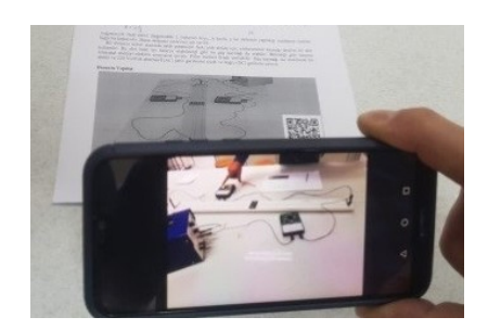
Figure 1 Students Interacting with QR Located in AR-based Laboratory Manual