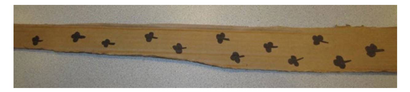
Figure 1. Sample of a student walking stick.