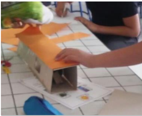
Reflection of light and mirrors