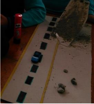
Friction force and motion