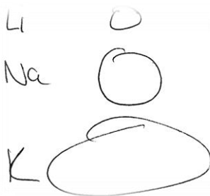
Figure 2. Louise’s “Snowman” drawing.

When she explained nuclear shielding in practice problems, she would always draw something similar to Figure 1 as she did the problem. Louise said this was the first year she had ever used this drawing, and she was going to continue to use it because she thought it helped student visualize nuclear shielding. The other drawing Louise used was her snowman drawing (See Figure 2).